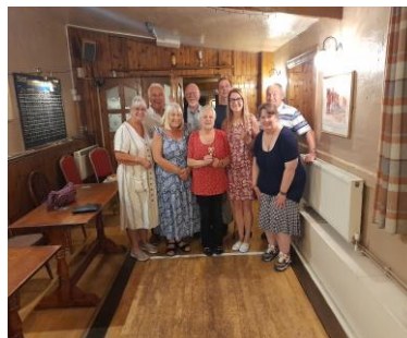
The Two Teams